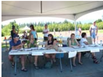
Parent volunteers at our meet

Parents with coaching experience are encouraged to participate in the practices whenever possible. Help is also needed with setting up of equipment, such as high-jump mats and hurdles, and to monitor event stations.